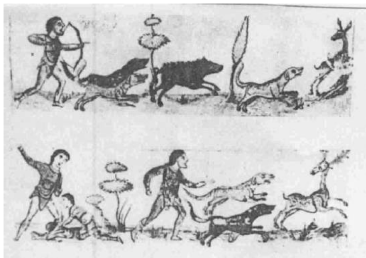
Fig. 3. Hunting for Deer and Boars. Fresco of the XI century. Kiev. St. Sophia Cathedral. Northwest Tower

Much of V. Monomakh's attention was paid to bring up young soldiers strong. He teaches that at war «Do not put off your accoutrements without a quick glance about you, for a man may thus perish suddenly through his carelessness.» [5]. Warriors performed their exercises by night and by day, in heat and in cold. During the times of Kievan Rus, hunting often had a ritual character. It was believed that it added strength, dexterity or wisdom of the one the warrior killed (fig. 3).