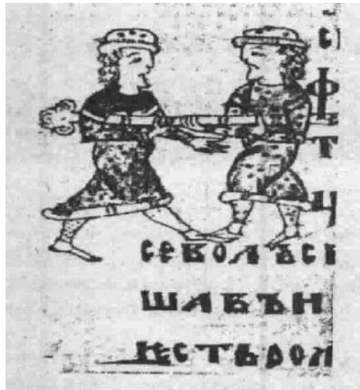
Fig. 2. Tug-of-war. Initial Letter «N» From the Old Russian Gospel

The analysis of historical sources reveals that in the Kievan Rus chronicles were a kind of literary anthology in reflecting real events in the history of society (fig. 2). Thus, «The Tale of the Past Years», written at the beginning of the XII century, cites events of previous years. It reflects the greatness and power of the people, the combination of spiritual and physical education by examples of selfless acts, patriotism, and the power of the spirit of definite individuals and people in general.